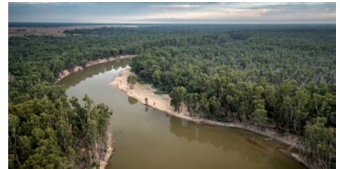
Photo: Murray River